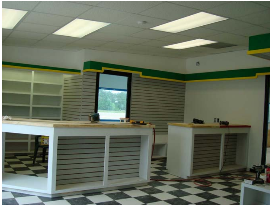
Figure 4. Race Registration and Administration Area

Figure four shows the race registration and Administration area.