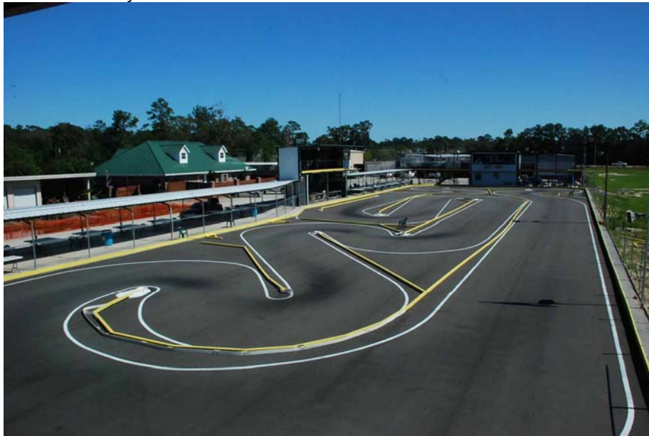
Figure 1. View of Gulf Coast Raceway track

Figure one shows the Gulf Coast Raceway racing surface. The racing surface dimensions are within IFMAR specifications.