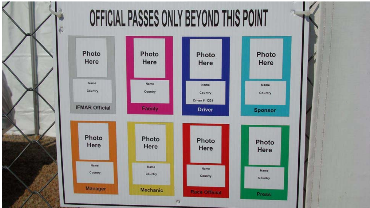
Figure 6. Examples of ID badges that will be issued

The following are frequencies that are permitted: