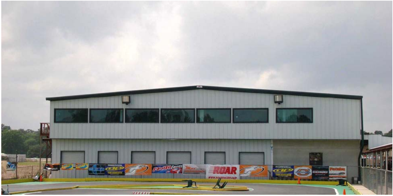
Figure 2. Race Control and Pit Area Building

Figure two shows the 4,000 square foot Race Control and Pit Area Building. The top floor is where the press room, race control, team meeting area and official private area is located. The lower floor holds the largest driver pit area. This area has three bathrooms, snack bar and the pit area can comfortably accommodate 150 drivers