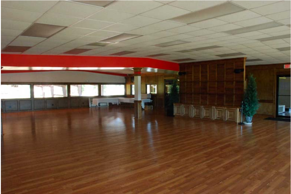
Figure 3. Press Area and Team Meeting Space

Figure two shows the 4,000 square foot Race Control and Pit Area Building. The top floor is where the press room, race control, team meeting area and official private area is located. The lower floor holds the largest driver pit area. This area has three bathrooms, snack bar and the pit area can comfortably accommodate 150 drivers