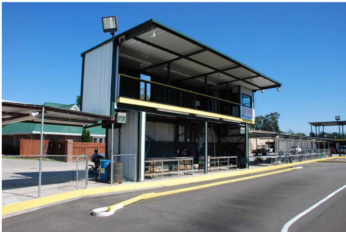
Figure 5. Driver Stand and Race Pit Area

Figure four shows the race registration and Administration area.